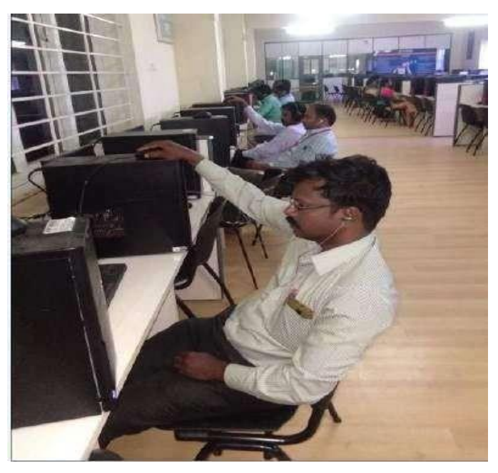
The staff members enthusiastically attending the workshop.

After attending the workshop the staff members had an idea about this SCILAB . More videos on SCILAB were given as softcopy to the staff members to prepare themselves and to attend the online Exam.