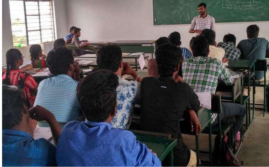
Presentation given by Resource Person.