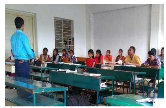
Alumni speech sessions