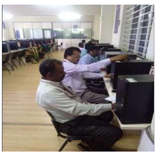
The staff members attending the online Exams.

The exam duration was about 45 minutes. After the exam, certificates were generated to the staff those who have secured above 40 % of marks to their individual User Id.